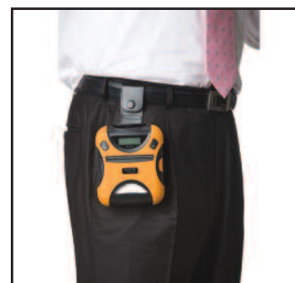
Belt Clip Included